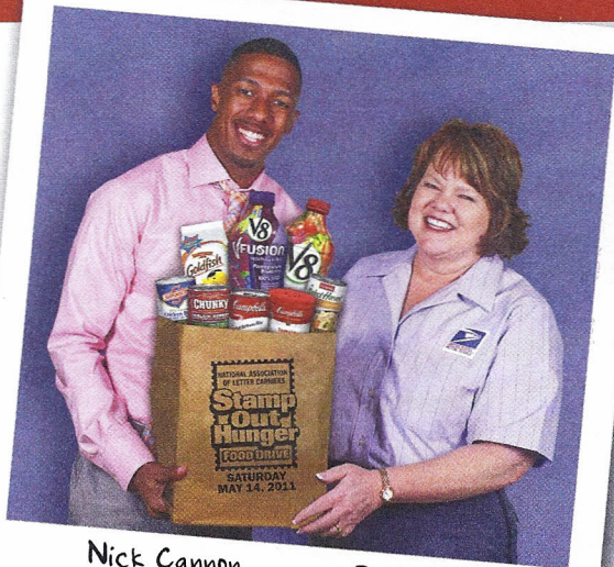
Nick Cannon Entertainer/Entrepreneur